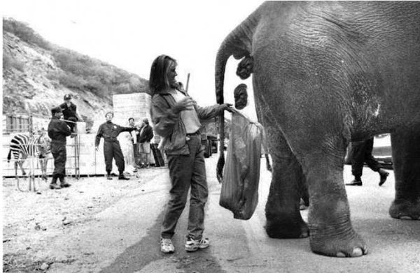
And you thought your job sucked

Here is a simple activity for you to identify where you are currently at. Just plot your pizza by marking a dot on the appropriate increment for each slice. The centre of the pizza is zero and the outside edge is ten. So go ahead and rate yourself out of ten for each area of your life. Once you have plotted the points simply join them with a straight line. How is your pizza looking? Would you eat it? If it was a wheel how far would it roll? If it is anything like mine used to be then it may explain why your life may not be heading in the direction you want.